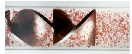
Oil into Water Dispersion

Our approach is to engineer our custody transfer solutions to meet the stringent requirements of the ISO 3171, ASTM D4177, and API 8.2 standards. All too often the focus in providing a solution is the manufacturer's performance measure, as opposed to the more objective approach which requires compliance to methods and standards.