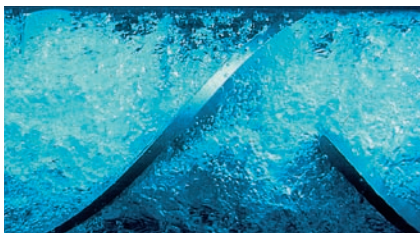
Gas into Liquid Dispersion

Mixing of an oil stream is critical if operators want to obtain the highest possible accuracy and repeatability, whether it is in watercut measurement or online sampling of hydrocarbons, spot sampling, or automatic grab sampling.